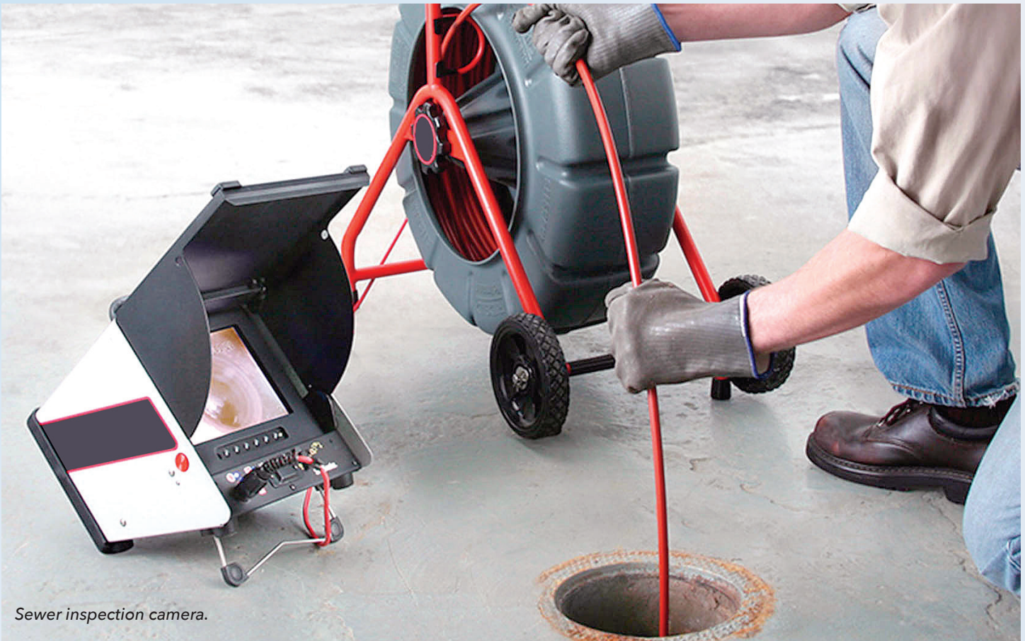
Sewer inspection camera.

waste, hair, flushable wipes and many more things. If there is a crack in the sewer line, tree roots can get through those cracks and plug up a sewer line. Older sewer lines can also collapse causing a plugged sewer line.